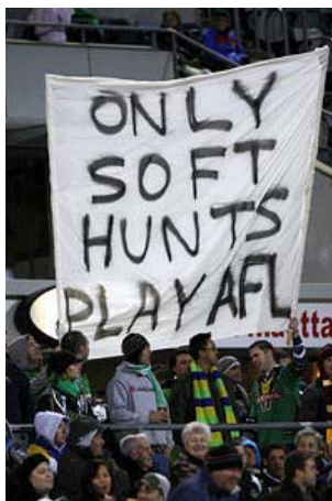
Inter-league rivalry at its finest